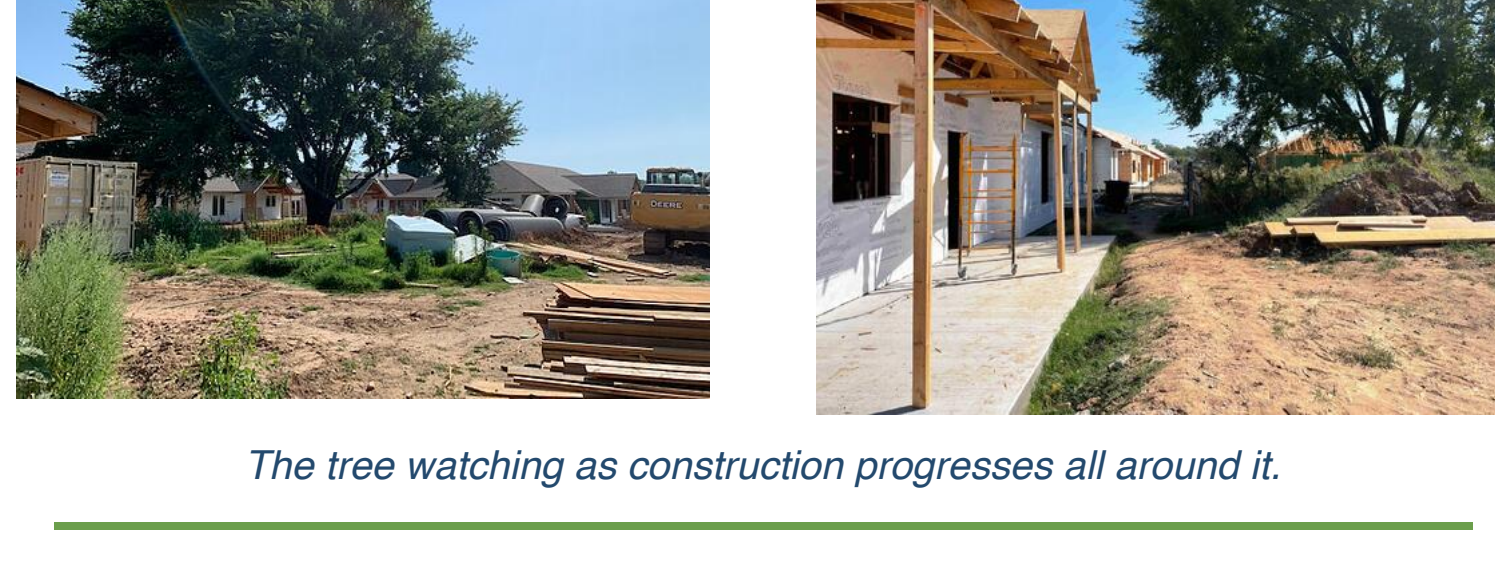
The tree watching as construction progresses all around it.