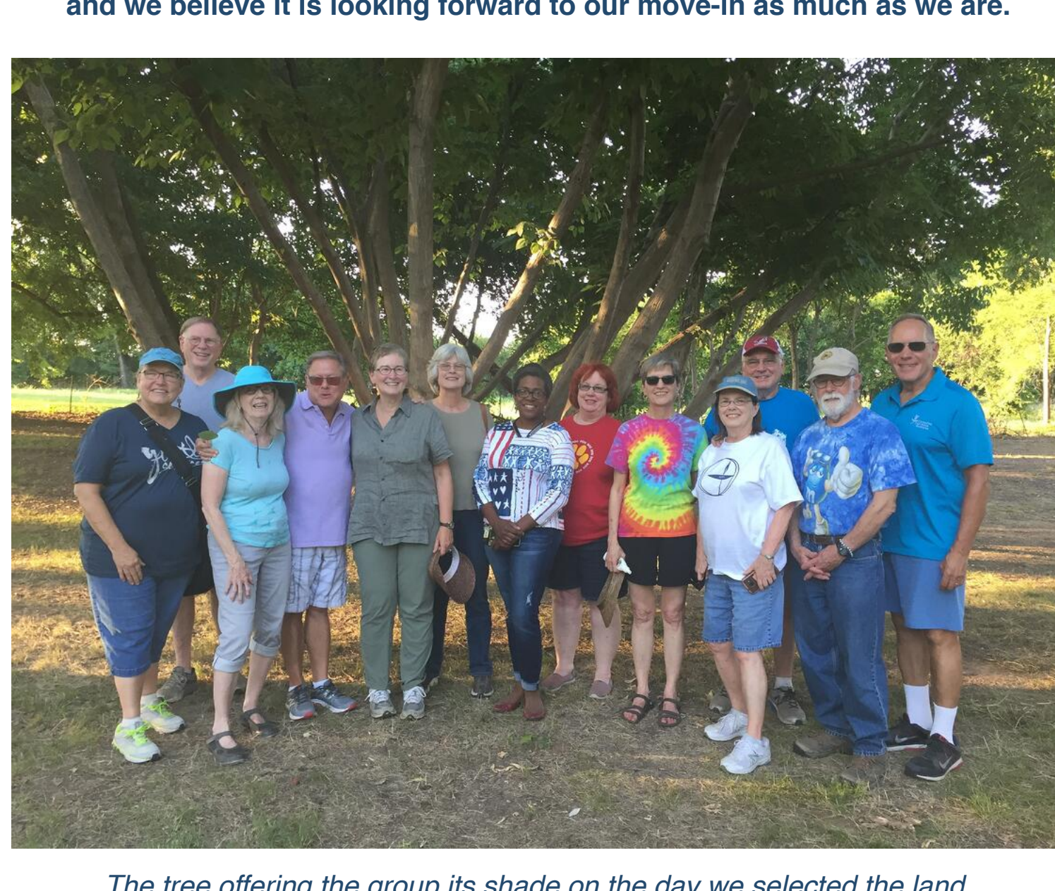
The tree offering the group its shade on the day we selected the land.

It was love at first sight when we saw this big tree on the property that would become the site for our homes. This tree has watched our community grow and we believe it is looking forward to our move-in as much as we are.