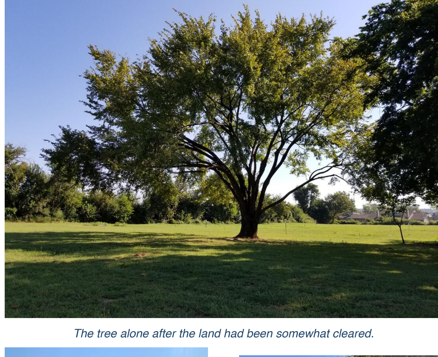
The tree alone after the land had been somewhat cleared.